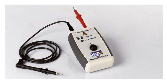
PLCK polarity checker

Checking the correct connection of CT's and VT's to protection relays is a problem because relays can be hundreds of meters away from the transformer. PLCK easilys solves the issue. When this test is started, DRTS 34 generates a special, not sinusoidal waveform, which is injected into the connection cables. The polarity check is easily performed by connecting it at the relay site. PLCK hast wo lights: green and red. The green light turns on when the polarity is correct; the red light turns on when the polarity is wrong.