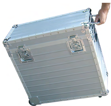
Custodia in alluminio