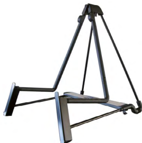
Stand up support

The stand-up support allows using the test set in a stand-up position. This is very useful in case of too small room or no support for the test set. There is enough room for the power supply cord, and for the cooling air to flow in.