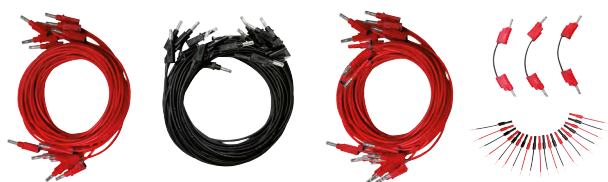
Optional set of testing cables