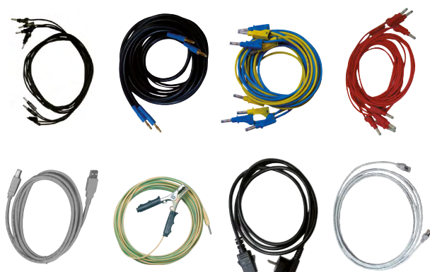
Standard set of testing cables