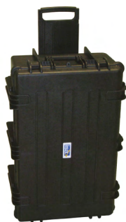
Valigia rigida di trasporto