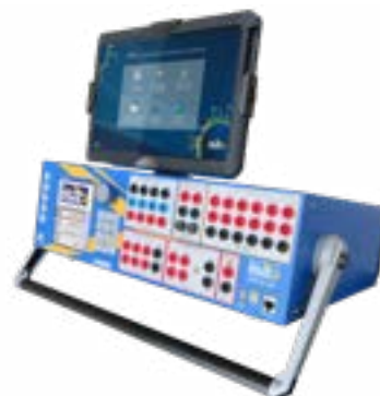
Local Touch Control

With the optional Local Touch Control the unit can be easily controlled using the rugged touch screen and the Manual Control software applications. The Local Touch Control can be used attached or detached to the test set. When used attached to the test set the rugged Touch Local Control is fixed to the test unit by means of a robust hinged module. If detached from the test set the Local Touch Control unit can be easily managed as a rugged tablet touch screen controller.