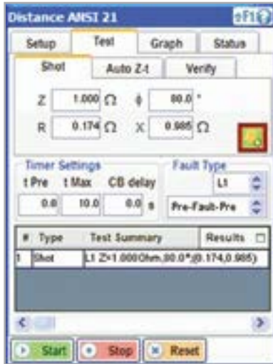
Distance relay test setup