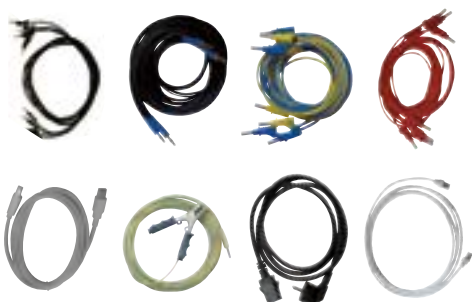
Standard set of testing cables