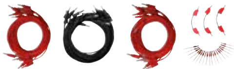
Optional set of testing cables

This option can be added to the basic cable kit to provide connection to all test set sockets. It includes also 20 adaptors for terminal block connections and 3 jumpers to parallel current outputs.