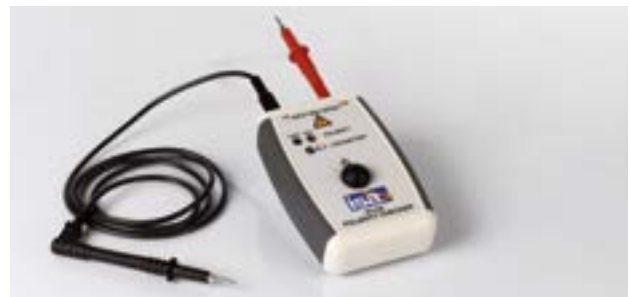
PLCK polarity checker

Checking the correct connection of CT's and VT's to protection relays is a problem because relays can be hundreds of meters away from the transformer. PLCK easily solves the issue. When this test is started, DRTS 64 generates a special, not sinusoidal waveform, which is injected into the connection cables. The polarity check is easily performed by connecting it at the relay site. PLCK has two lights: green and red. The green light turns on when the polarity is correct; the red light turns on when the polarity is wrong.