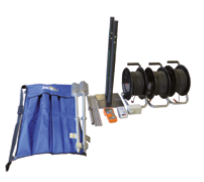
Ground grid test acessories kit

• One resistor box for the step and touch test