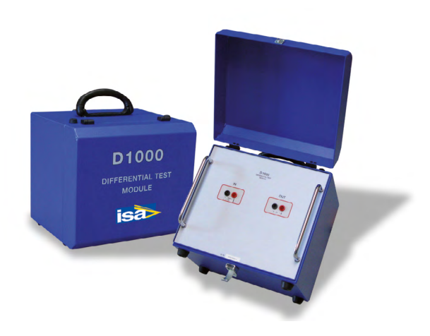
D 1000 Differential relay test module