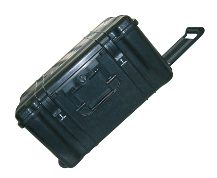
Heavy duty transport case

Heavy duty transport case in black plastics, with wheels, cover and handle.