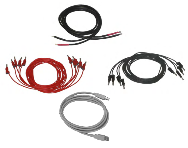
T 1000 PLUS - Standard cable kit

The kit includes cables for any kind of connection.