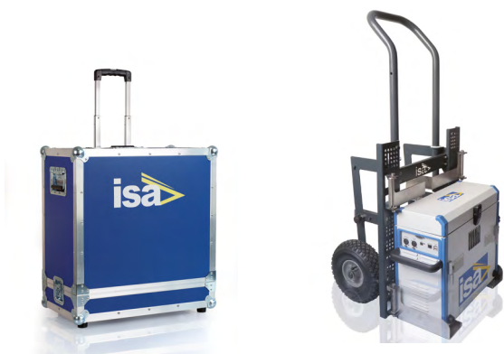
eKAM Transport Case and Trolley

The trolley eases the transport of eKAM.