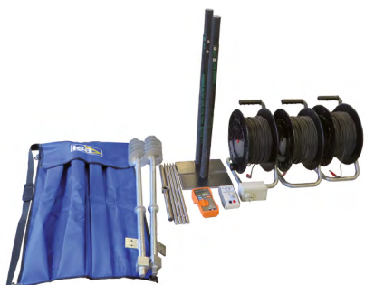
GROUND GRID TEST ACCESSORIES KIT