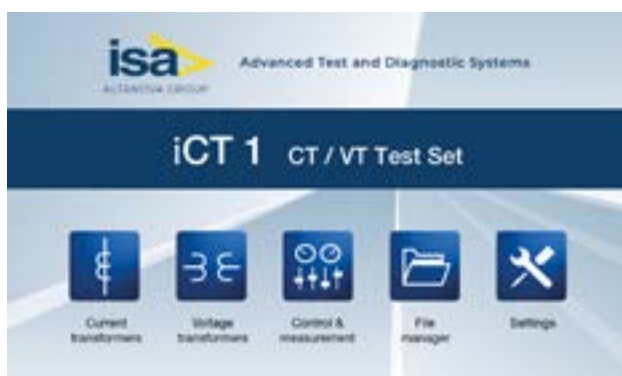
Main Menu Display